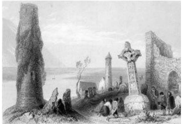
Bartlett's 1840 engraving of Clonmacnoise, Co. Offaly