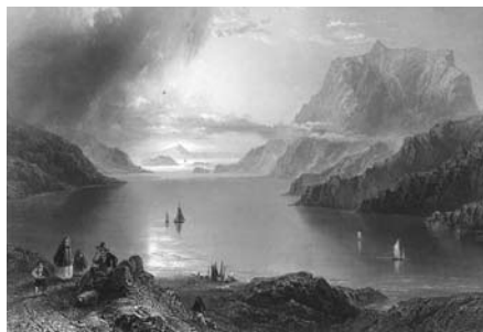
Bartlett's 1840 engraving of Eagle Mountain, Killeries, Connemara